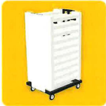
Stores 10 Mod-Fence™ Panels and 12 Mod-Fence™ Posts

Transportation and storage has always been a headache when it comes to temporary fencing. Most solutions are heavy and bulky, and must be moved with a forklift. The Mod-Cart™ by Mod-Fence™ is compact, lightweight, and can hold up to 60 linear feet of Mod-Fence Event Fencing™, making your next fence setup a breeze!