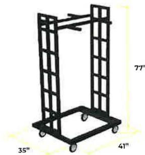
Compact enough to fit through a standard doorway!